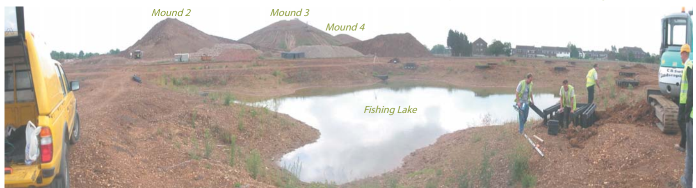
Above: View looking north east from fishing lakes towards Mounds 2, 3 and 4 and site stockpiles. Fishing platform construction being done by Swift Landscapes.