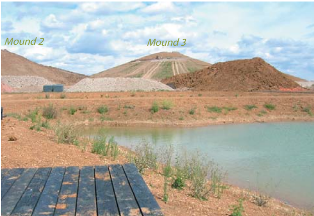
Above: 1 of 6 fishing lakes with fishing platform. Mounds 2 and 3 behind.