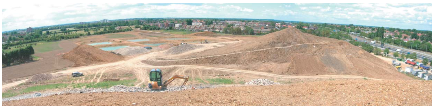
Above: View looking south west from the top of Mound 3 towards the 6 fishing lakes, meadow area, Northolt Golf Course, Mound 2 and the A40.