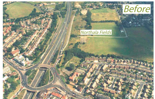
Above: Perspective view of Target Roundabout and Northala Fields in 1999.

By the middle of August 2006 approximately 56,000 truck loads of inert waste (uncontaminated material) had been deposited within the new park. All future lorry loads will be used to complete the two western Mounds (Mounds 1 and 2) to desired finished levels.