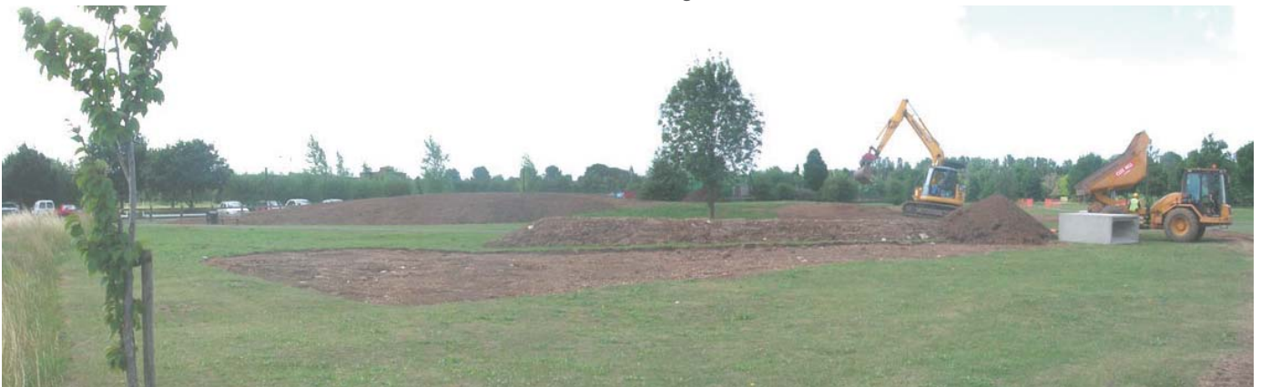
Above: CJ Pryors carrying out improvements to Medlar Farm including path, mound and swale creation, and Golf Course entrance works, in July 2006.