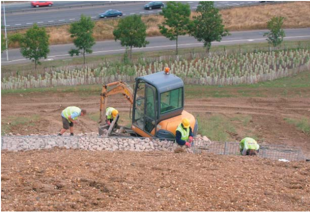
Above: Mound 3 spiral gabion wall walkway construction.